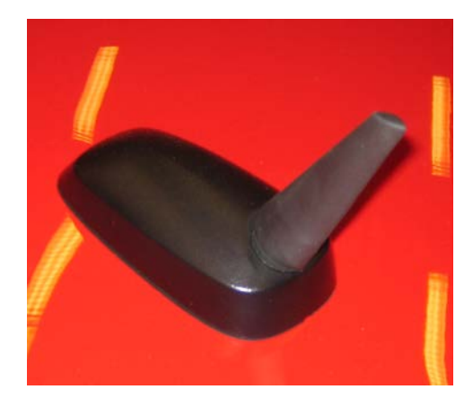
Caption: The antenna used for satellite radio can be many different shapes, including one that looks like a shark fin.

providers of satellite radio – Sires and XM. Both offer many channels of digital radio for a monthly fee. Because they use satellite and repeater stations in large cities, the radio channels can be received throughout the country. Another music choice includes MP3 players and USB ports in vehicles that now allow the use of stored music files instead of receiving line broadcasts. However, sporting events and talk shows make satellite radio a great option for those who travel.