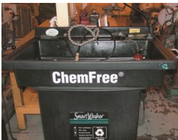
FIGURE 2.7 Using a water-based cleaning system helps reduce the hazards from using strong chemicals.

ALWAYS LEARNING Automotive Steering, Suspension and Alignment, 7e James D. Halderman Copyright © 2017 by Pearson Education, Inc. All Rights Reserved. PEARSON