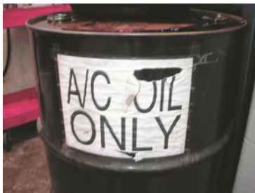
FIGURE 2.10 Air-conditioning refrigerant oil must be kept separated from other oils because it contains traces of refrigerant and must be treated as hazardous waste.

ALWAYS LEARNING Automotive Steering, Suspension and Alignment, 7e Copyright © 2017 by Pearson Education, Inc. All Rights Reserved. PEARSON