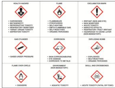
FIGURE 2.12 The OSHA global hazardous materials labels.