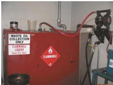
FIGURE 2.4 A typical aboveground oil storage tank.

ALWAYS LEARNING Automotive Steering, Suspension and Alignment, 7e James D. Halderman Copyright © 2017 by Pearson Education, Inc. All Rights Reserved. PEARSON