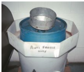
FIGURE 2.8 Used antifreeze coolant should be kept separate and stored in a leakproof container until it can be recycled or disposed of according to federal, state, and local laws. Note that the storage barrel is placed inside another container to catch any coolant that may spill out of the inside barrel.

ALWAYS LEARNING Automotive Steering, Suspension and Alignment, 7e James D. Halderman Copyright © 2017 by Pearson Education, Inc. All Rights Reserved. PEARSON