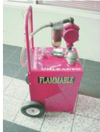
FIGURE 2.9 This red gasoline container holds about 30 gallons of gasoline and is used to fill vehicles used for training.

ALWAYS LEARNING Automotive Steering, Suspension and Alignment, 7e Copyright © 2017 by Pearson Education, Inc. All Rights Reserved. PEARSON