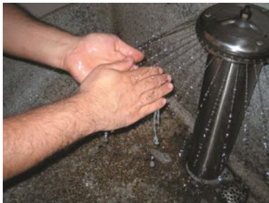
FIGURE 2.5 Washing hands and removing jewelry are two important safety habits all service technicians should practice.

ALWAYS LEARNING Automotive Steering, Suspension and Alignment, 7e James D. Halderman Copyright © 2017 by Pearson Education, Inc. All Rights Reserved. PEARSON