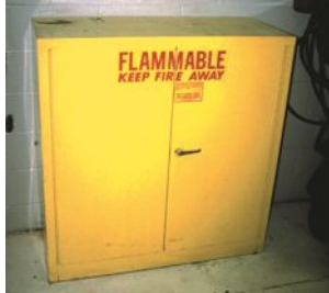
FIGURE 2.6 Typical fireproof flammable storage cabinet.

ALWAYS LEARNING Automotive Steering, Suspension and Alignment, 7e James D. Halderman Copyright © 2017 by Pearson Education, Inc. All Rights Reserved. PEARSON