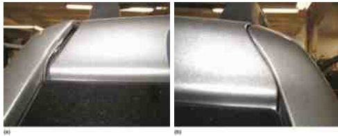
FIGURE 70.3 (a) The left side of a lift gate on an SUV shows a wide gap. (b) The right side of the same lift gate on the passenger side shows a very small gap. This shows that this vehicle may have been in an accident and not properly repaired.