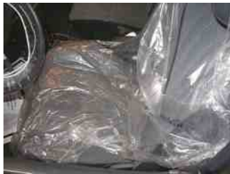
FIGURE 70.4 Plastic protective covering is used on all surfaces that may be touched by others during transport from the assembly plant to the selling dealer. This plastic is removed at the dealer before the vehicle is delivered to the customer.