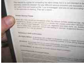
FIGURE 4.3 Note the skill levels of the technician and the extra time that should be added if work is being performed on a vehicle that has excessive rust or other factors as stated in the time guide.