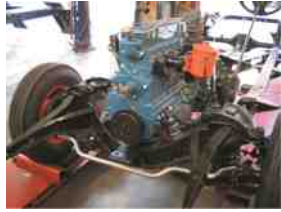
FIGURE 1.3 A chassis of a 1950s era vehicle showing the engine, drivetrain, frame, and suspension.