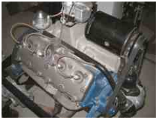
FIGURE 1.7 A Ford flathead V-8 engine. This engine design was used by Ford Motor Company from 1932 through 1953. In a flathead design, the valves located next to (beside) the cylinders.