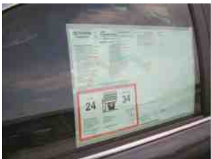
FIGURE 1.8 A Monroney label as shown on the side window of a new vehicle.