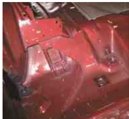
FIGURE 1.5 Note the ribbing and the many different pieces of sheet metal used in the construction of this body.