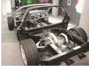
FIGURE 1.6 A Corvette without the body. Notice that the vehicle is complete enough to be driven. This photo was taken at the Corvette Museum in Bowling Green, Kentucky.