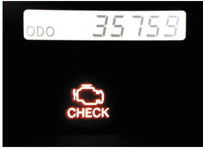
FIGURE 11-1 A typical malfunction indicator lamp (MIL) often labeled "check engine."

PEARSON Automotive Fuel and Emissions Control Systems 3e Copyright © 2012, 2009, 2005 Pearson Education, Inc. Upper Saddle River, NJ 07458 • All rights reserved.