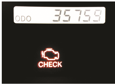
Figure 10.1 A typical malfunction indicator lamp (MIL) often labeled “check engine” or “service engine soon” (SES).

ALWAYS LEARNING Advanced Engine Performance Diagnosis, 6e James D. Halderman Copyright © 2016 by Pearson Education, Inc. All Rights Reserved. PEARSON