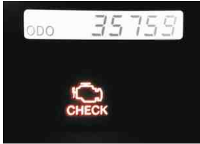
FIGURE 19-1 A typical malfunction indicator lamp (MIL) often labeled "check engine."

PEARSON Automotive Engine Performance, 3/e By James D. Halderman Copyright © 2010, 2007, 2003 Pearson Education, Inc. Upper Saddle River, NJ 07458 • All rights reserved. 1