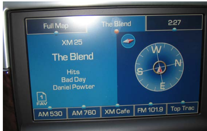
Caption: An XM satellite radio display shown with a compass heading on this Cadillac.