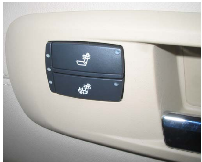
Caption: The door-mounted heated seat control on a Cadillac, showing that the back only or both the back and seat bottom can be individually selected.