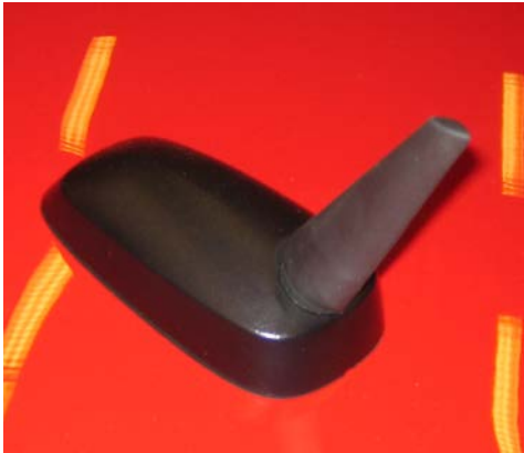
Caption: The antenna used for satellite radio can be many different shapes, including one that looks like a shark fin.

providers of satellite radio – Sires and XM. Both offer many channels of digital radio for a monthly fee. Because they use satellite and repeater stations in large cities, the radio channels can be received throughout the country. Another music choice includes MP3 players and USB ports in vehicles that now allow the use of stored music files instead of receiving line broadcasts. However, sporting events and talk shows make satellite radio a great option for those who travel.